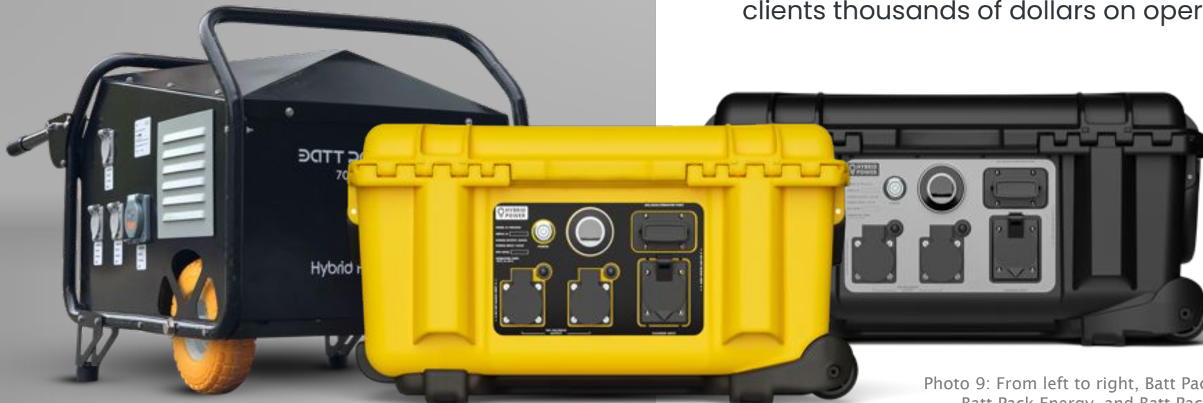
Photo 9: From left to right, Batt Pack Jupiter, Batt Pack Energy, and Batt Pack Pro

Our line of fuel-free and hybrid generators offers best-in-class performance and is designed with our users in mind. From a small, portable 3000W power pack for drills and jackhammers to a 150,000W tower crane and full construction site power, we build custom power solutions based on our five off-the-shelf generators. Our systems can be charged via grid power, hybrid diesel, solar, wind, or even from your vehicle, creating a highly effective and flexible platform. Our mission is to save our clients thousands of dollars on operations.