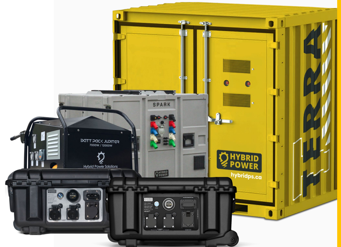
From left to right: Batt Pack Pro, Batt Pack Jupiter, Batt Pack Spark, Batt Pack Energy, TERRA

COMMERCIALIZED CLEANTECH WITH GROWTH AHEAD